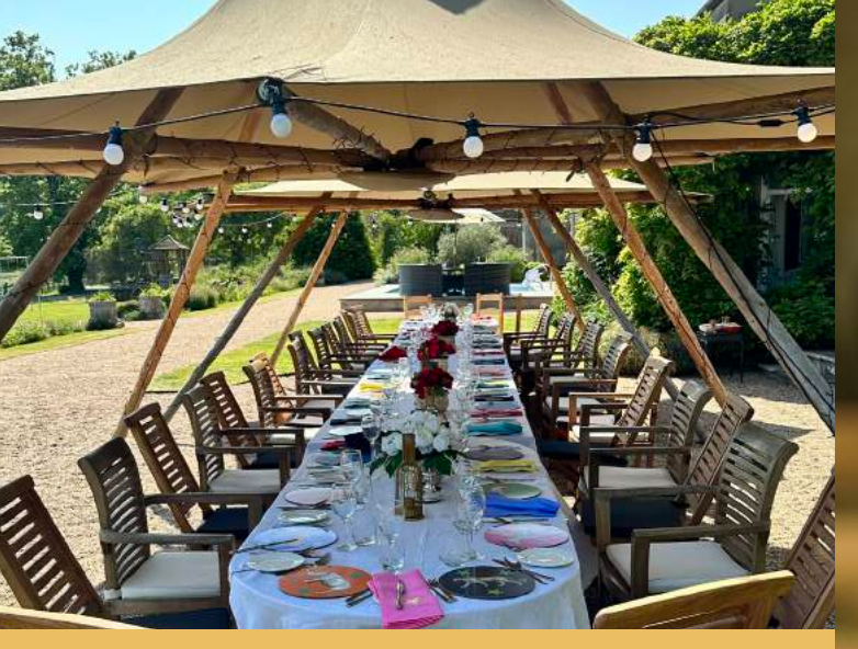
RELAX & UNWIND