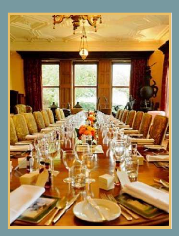
Old Dining Room