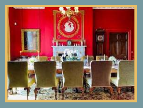
Red Dining Room